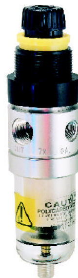
Model # 91-216: Filter/Relief Valve for OEM

Special porting, shapes and sizes are possible with that flexible machining process. Monnier can adapt to specific customer requirements in a fraction of the time the industry is accustomed to. Since time and money are always at a premium, let Monnier become the value-added solution provider for your air preparation requirements.