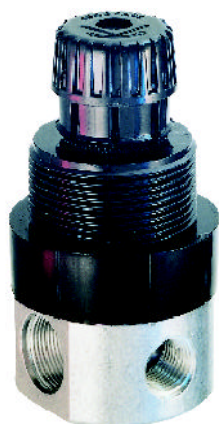
Model # 91-129: Adjustable Relief Valve for the Medical Industry

That philosophy is the reason Monnier manufactures over 1000 specially engineered solutions annually in addition to the 3000 standard products in our catalog.