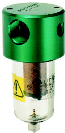
Model #s 92-204: Filter Assembly for the Plastic Industry

On the other hand, if you choose to go with a standard Monnier air preparation product or a custom engineered solution simply fill out the form in the back of the catalog and fax it to us . It's that easy!