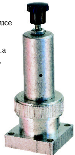
Model # 91-206: Air/Oil Regulator for OEM

The only thing standing between you and having the ideal product for your application are these two little pages. So we'll let you get right to it.